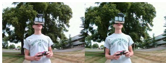
Fig. 1. Stereo images of a user operating a 3D system. The system has two video cameras, a mobile phone, a 3D viewing goggle and a game controller.

Another challenge of a 3D content sharing platform is providing a method for users to grab their own 3D photos and videos. As normal mobile phones do not allow for users to grab 3D content with the built in camera, it is necessary that they use some sort of 3D camera extension to their mobile phone, or use their own individual 3D camera all together.