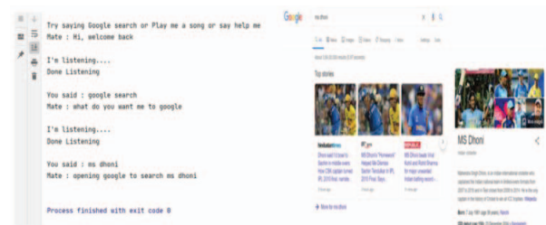
Fig. 3. Output screen of performing Google Search

As shown in below Fig 3. When we ask the voice assistant to search 'MS DHONI', it receives the request and performs the action by searching google.